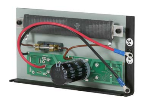
SRST50, 70, 80, 90, 175, 185