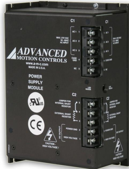
PS30A Series Power Supply

The DC bus voltage is 1.4 times AC voltage (RMS), e.g. 340 VDC from 240 VAC for the PS30A and 170 VDC from 120 VAC for the PS30A-LV. During braking much of the stored mechanical energy is fed back into the power supply and charges the bus capacitor to a higher voltage. If this voltage reaches the drive's over-voltage shutdown point, output current and braking will cease. To ensure smooth braking of large inertial loads, a built-in shunt regulator is provided.